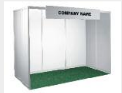
Example of stand area

+44 (0) 208 744 1075 or e-mail: conference@globalcommoditiesgroup.com